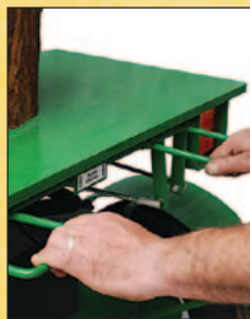
Double handed control system – keeps hands safe