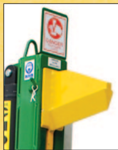
Patented vertical action sliding blade

vertical sliding blade and the control system, the of wood splitters are and most user friendly