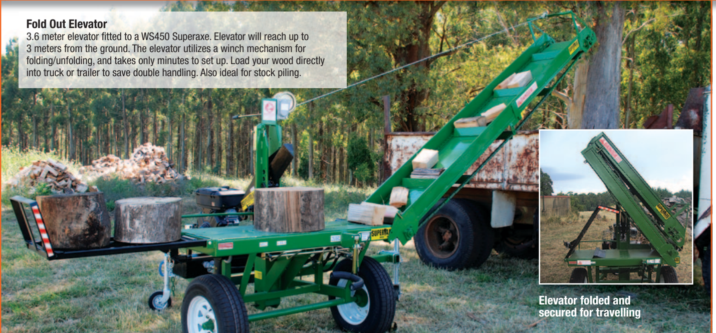
Elevator folded and secured for travelling

3.6 meter elevator fitted to a WS450 Superaxe. Elevator will reach up to 3 meters from the ground. The elevator utilizes a winch mechanism for folding/unfolding, and takes only minutes to set up. Load your wood directly into truck or trailer to save double handling. Also ideal for stock piling.