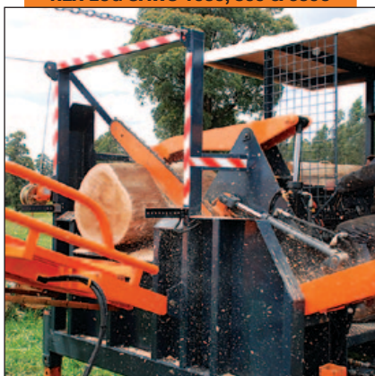
REX LOG SAWS 1050, 800 & 650C

Will load and dock logs up to 1050mm in diameter. Fully self-contained unit requires one operator. Has a similar running cost to one chainsaw, 3-4 times the output.