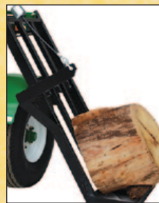
Back saving Log Lifter