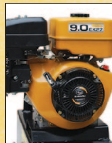
EX Series Subaru 9 HP Engine with 3 years warranty