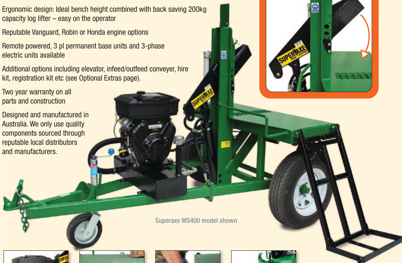
Superaxe WS400 model shown